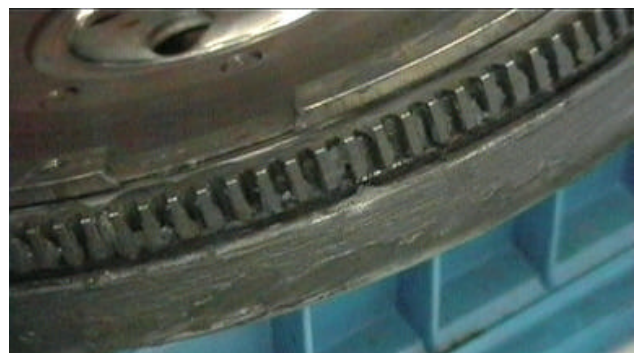
The lubricant emerges between the primary and secondary flywheels. The lubricant has been destroyed by overheating.