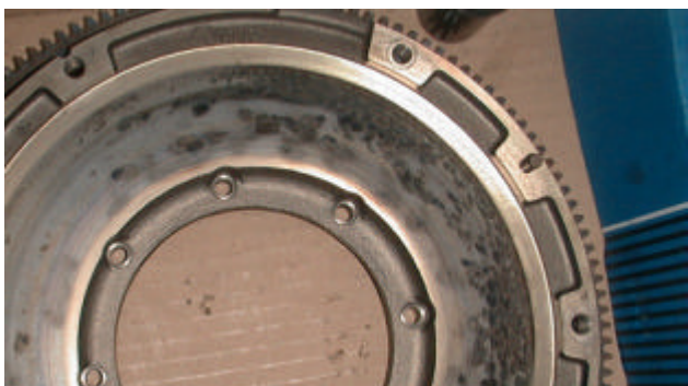
Overheated secondary flywheel. Heat cracks, burn marks on the friction surface of the secondary flywheel.